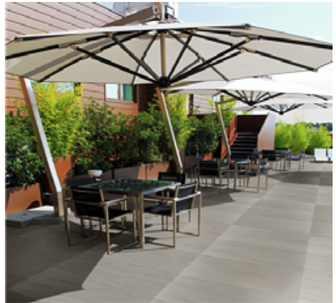
Figure 5 Installed product

The environmental burdens and benefits of obtaining secondary material from waste generated at the manufacturing stage (waste such as cardboard, plastic and wood), at the installation stage (tile waste, tile packaging waste: cardboard, plastic and wood) and at the end of life of the product have been considered.