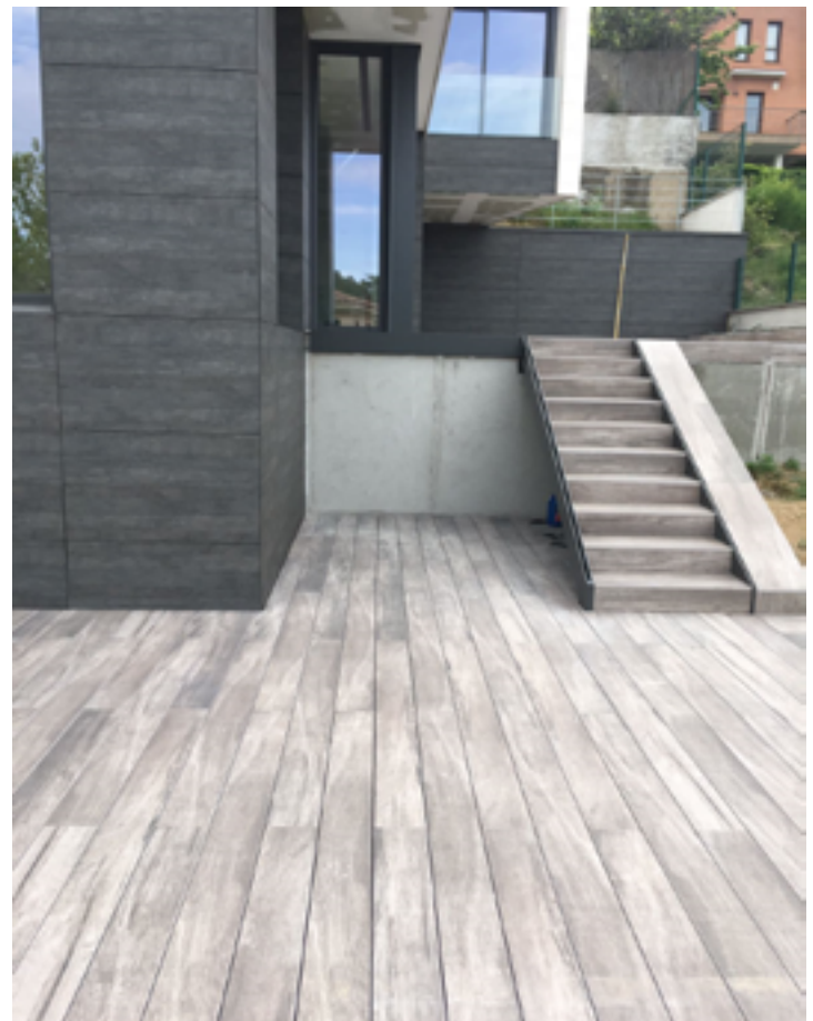
Figure 1 Installed product