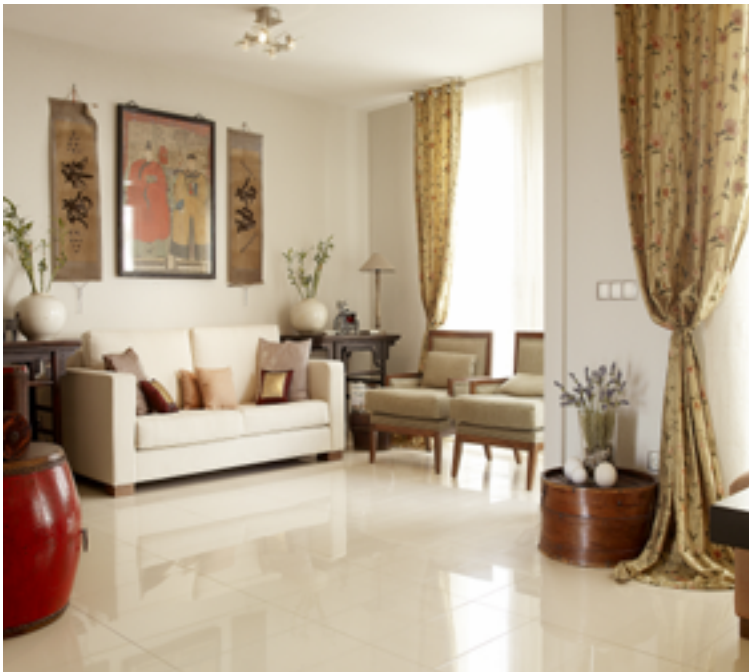
Figure 4 Installed product

The waste derived from the packaging of the pieces is managed separately according to the geographical location of the installation site. Otherwise, 3% of product losses have been considered at the installation stage.