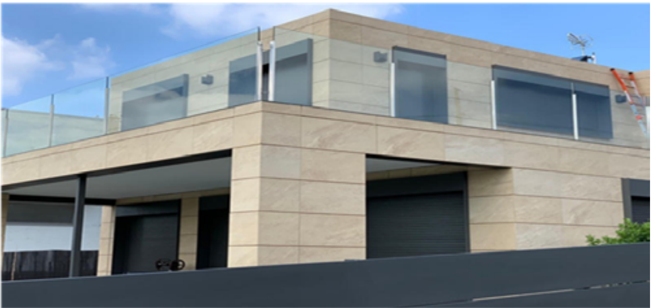
Figure 2 Installed product

The results of the sizes associated with the highest and lowest environmental impact show deviations of more than 10% from the weighted average. Annexes I and II show the environmental impact results of the reference with minimum and maximum impact values respectively.